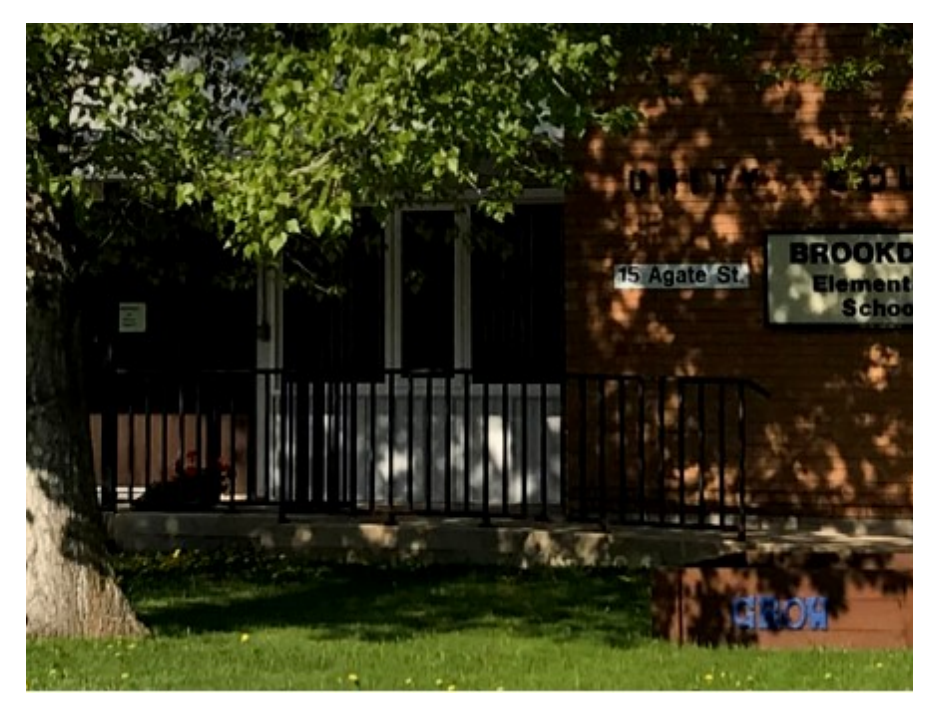
Brookdale School - Front Entrance